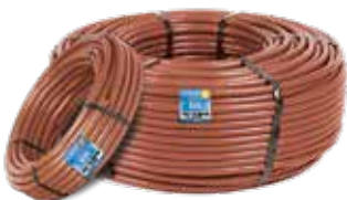
EXCEL™ Pressure Compensating Dripline with Check Valve