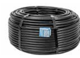
EXCEL™ PCD Dripline