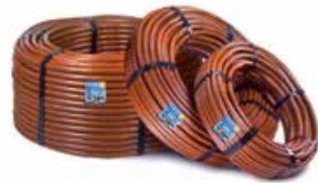
EXCEL™ Pressure Compensating (PC) Dripline