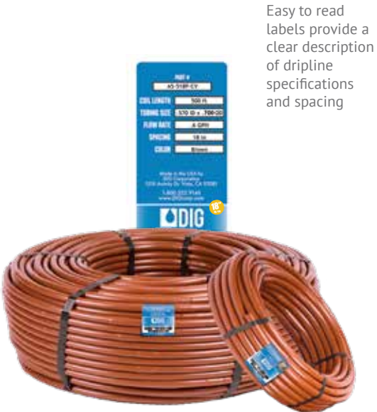
Easy to read labels provide a clear description of dripline specifications and spacing