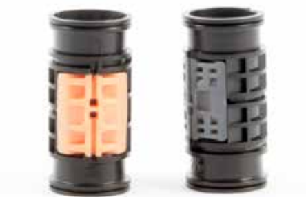
The dripline drip emitter's check valve feature prevents water draining when water pressure drops below 2.5 PSI, protecting the drip emitters from siphoning sediment, soil particles and debris at the end of each irrigation cycle.